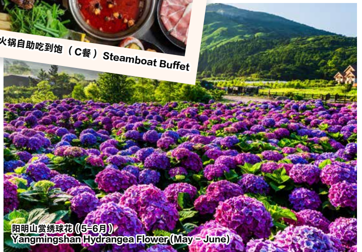
阳明山赏绣球花 (5-6月) Yangmingshan Hydrangea Flower (May - June)