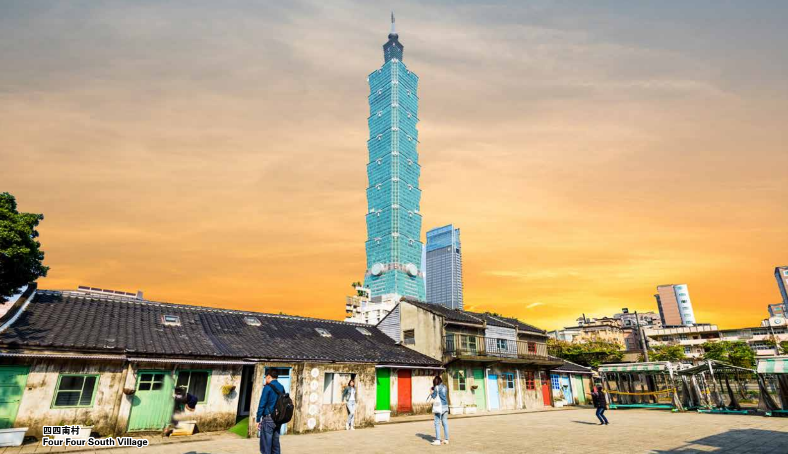
四四南村 Four Four South Village