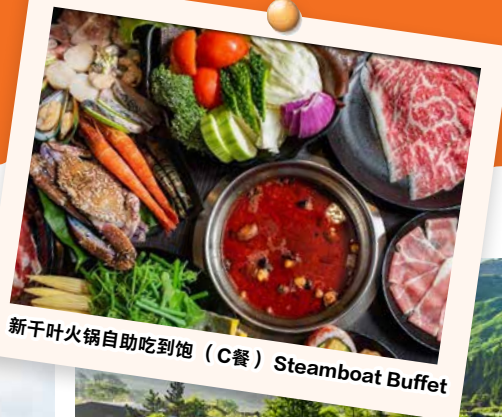
新千叶火锅自助吃到饱 (C餐) Steamboat Buffet

美食: 新千叶火锅自助吃到饱 (C餐) | 怀旧料理 GOURMET: Steamboat Buffet | Nostalgic Cuisine