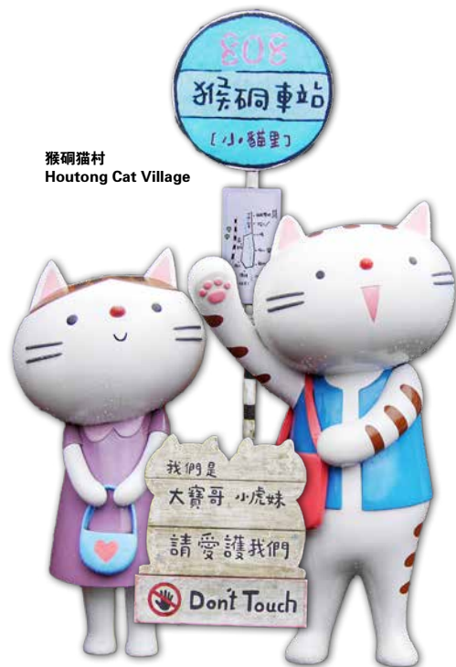
猴硐猫村 Houtong Cat Village