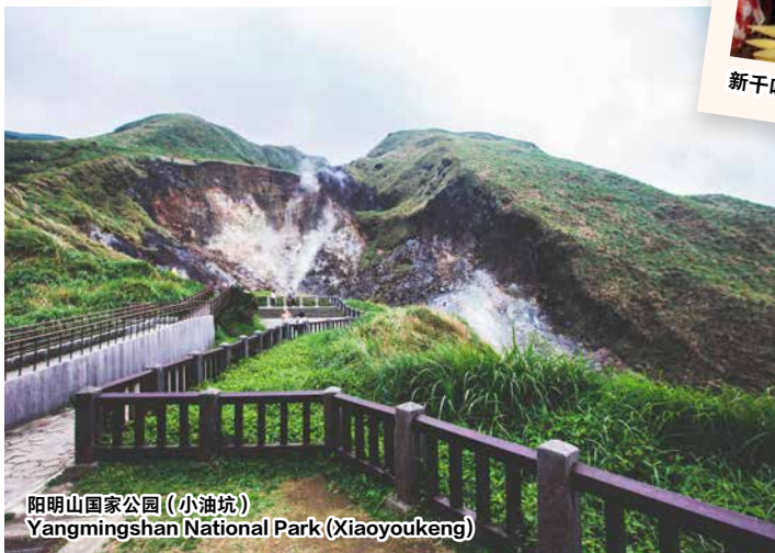
阳明山国家公园 (小油坑) Yangmingshan National Park (Xiaoyoukeng)